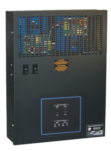
AD-4K 4,000 Watt Automated Dimmer

These units feature 2,000 and 4,000 watt capacities in either 120 or 220 volt models.