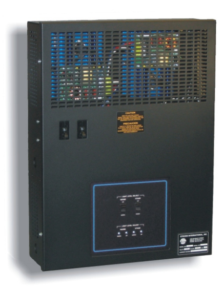
AD-4K 4,000 Watt Automated Dimmer